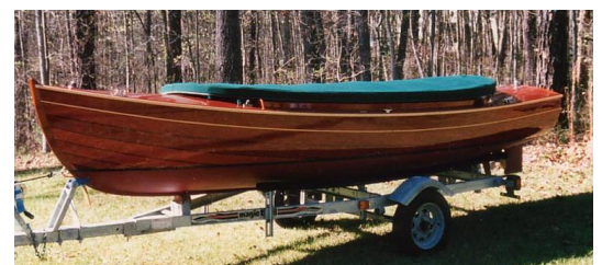
Top drops down for travel

For that "Turn of the Century" look. A nine-foot long canopy of Sunbrella fabric with a wood framework and mahogany poles. One person can install it in less than five minutes—has an overhead courtesy and running lights built in.