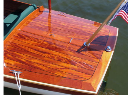
Ice box closed

An insulated cooler installed under the aft deck, accessed by a hatch neatly cut from the mahogany deck so the wood grain runs consistently through. Perfect for entertaining—it holds approximately two bags of ice and eight to twelve drinks and is large enough to accommodate tall wine bottles. Water runs out an overboard drain—so there's no need to empty ice. This is our most popular option.