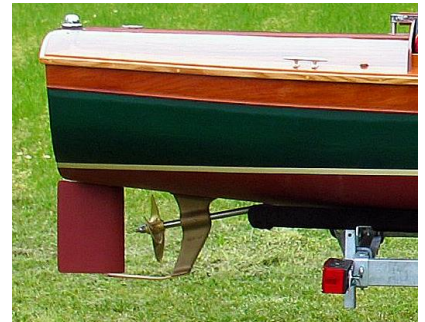
Standard running gear without full keel