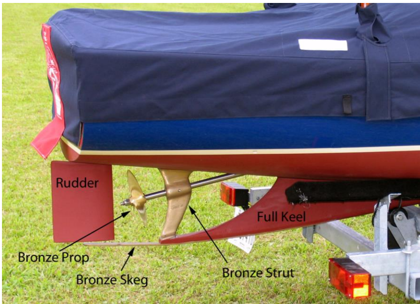
Full keel protection for running gear